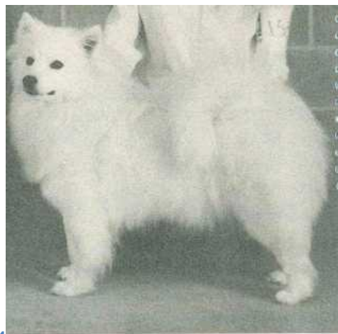
Figures 3 and 4