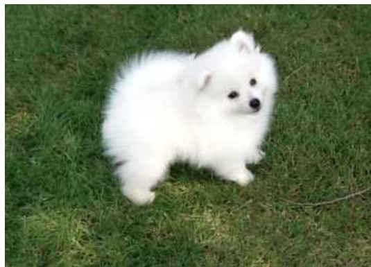
Toy American Eskimo (puppy)

The American Eskimo Dog is a multi-purpose working farm dog. A judge should be looking for a dog that is well-balanced, that trots, but does not pace, is agile, and can cover the most ground effortlessly. The dog should appear to float with excellent reach and drive. A good example of reach and drive appears below as Figure 1. Please note that the dog's front foot is even with the end of his nose. This indicates correct lay back of the shoulder and a deep chest giving this dog the ability to reach correctly. Depth of chest extends approximately to point of elbows, The rear foot is off the ground showing the dog's ground covering ability as well as his driving ability. This also illustrates well angulated hindquarters and well bent stifles. As speed increases, the American Eskimo Dog will single track with the legs converging toward the center of gravity while the back remains firm, strong and level. Gait is a very important aspect of the American Eskimo Dog. A judge should know that the animal should single track and look for the best specimen that conforms to the standard.